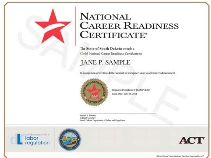
Workforce Readiness-Status of the Nation Utilizing the National Career Readiness Certificate